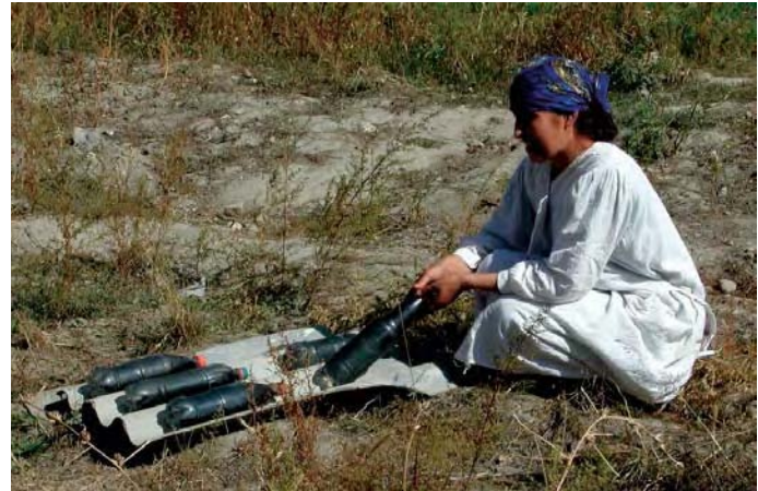
Fig. 3: Village Health posts get now clean drinking water by using SODIS.

It proved to be an effective way to introduce new ideas to the rural communities by first addressing schools. Children were open to try the new method. Some schools made it even mandatory for their pupils to bring bottles to the school and have them used for SODIS. Each child had its own bottle with clean drinking water!