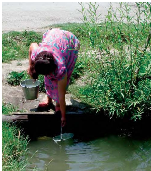
Fig. 1: In many places, people get their drinking water from unprotected, open ponds.

To bring about real improvements in health, the introduction of new treatment methods has to go hand in hand with hygiene promotion.