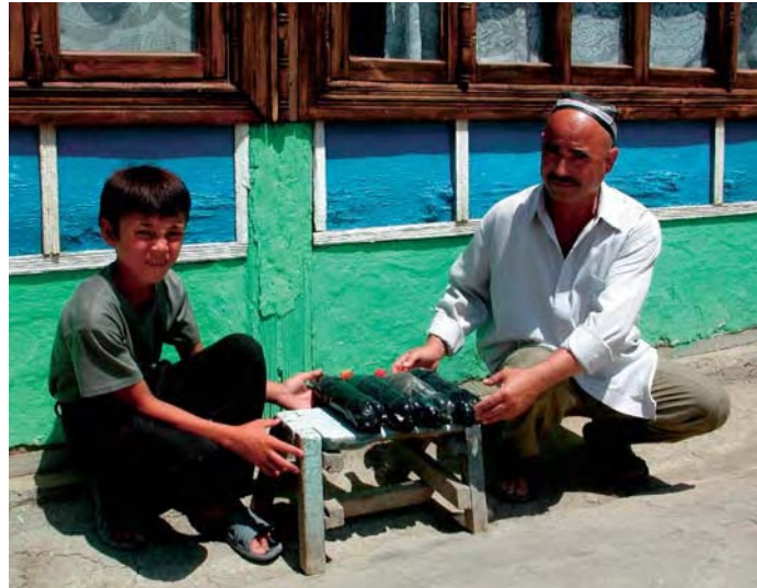
Fig. 4: SODIS appears to be an ideal method for the rural population in Uzbekistan