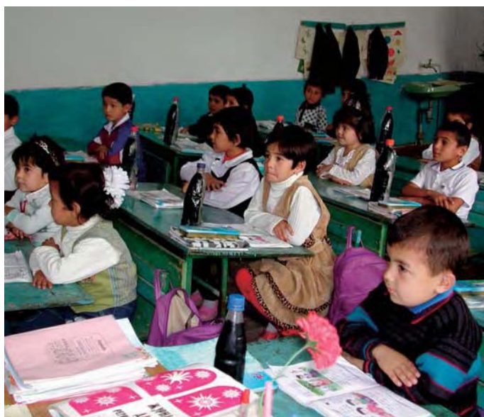
Fig. 2: Schools required their kids to bring their own SODIS bottle

JDA trained its local SODIS staff, consisting of one coordinator, two trainers and four promoters on the technical aspects of SODIS, as well as community development practices, facilitation, PRA methods and Adult Teaching techniques. The promoters went out to the villages regularly for the introduction of SODIS to many segments of the society and carry out regular supervision.