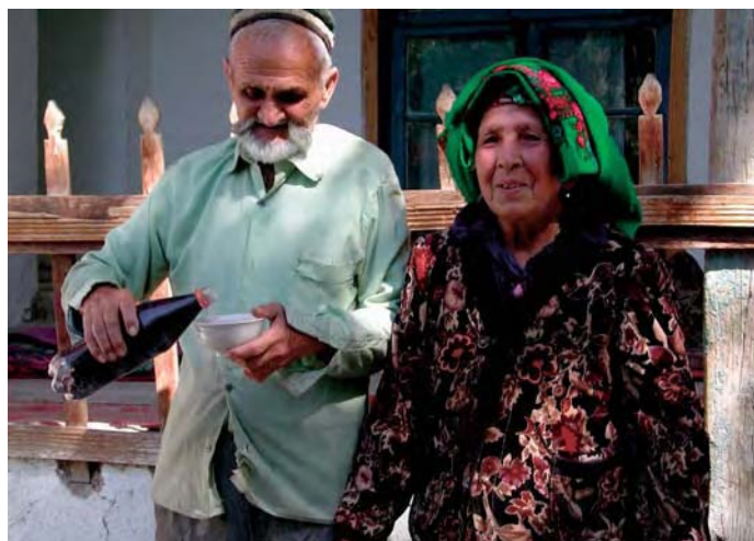
Fig. 7: An elderly Uzbek couple drinking SODIS water.

SODIS has the potential to improve the health of many people in Central Asia. It is a simple, cost-effective method that saves natural resources and could easily be applied in every household. It puts the responsibility for the people’s health back into their own hands.