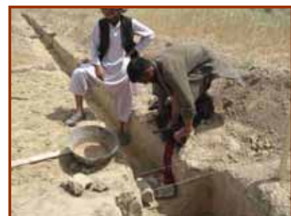
Making the sacrifice at the construction site.

Please consider supporting JDA this year. We’d love to hear from you.